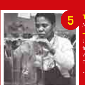
TALKING WOMEN 2

he Tower Sculpture acts as a beacon to announce the journey through the Donkin Reserve and responds to its surrounding elements to allow vind and light to bring it to life.