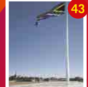
GREAT FLAG Trident Support

This 470 square metre mosaic, situated between the Pyramid and the Great Flag celebrates the multi-cultural, the heritages, the diverse histories he city and the province.