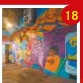
BUS STATION MURAL 4BlindMice

This mural is a carefully constructed design that celebrates public transport and the daily journeys ndertaken by the people of this city.