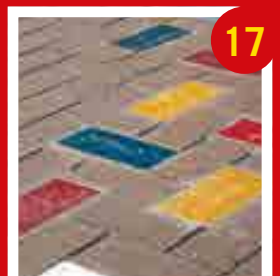
WALK OF WORDS by a collective of crafters

A public art experience, where humour, vibrance and colour meet the gritty nature of everyday street ife through a graphic and illustrative interpretation of Port Elizabeth's inner city ambience.