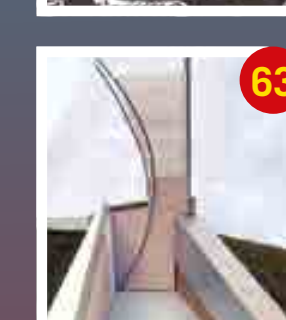
OUTH END GLASS SCULPTURE

This old optical technique used by the likes of Leonardo Da Vinci and Michelangelo, is a combination of optical illusion and mathematics