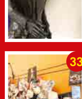
33 <sup>76</sup> YOUTH

The artwork is a statement about the 76 generation and represents the spiritual journey