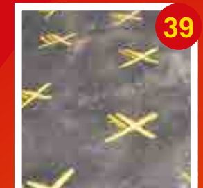
ELECTION QUEUE The Workplace Architects

A collaboration of artists used value words in ifferent languages to represent the New South Africa and it's prosperity as a democratic nation.