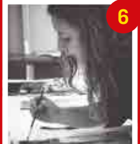
TALKING WOMEN 3

he stairway is an experiential journey that starts darkness and turbulence and progresses to a new dawn and explosion of colour, hope and new