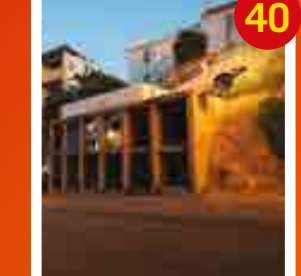
WHITES ROAD WALL

This mural is a carefully constructed design that celebrates public transport and the daily journeys ndertaken by the people of this city.