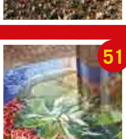
ARMONY IN NATURE

This old optical technique used by the likes of Leonardo Da Vinci and Michelangelo, is a combination of optical illusion and mathematics