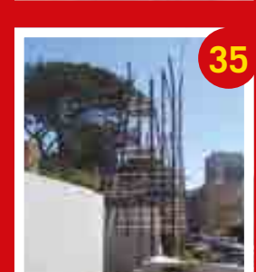
TOWER SCULPTURE he Workplace Architects

A pattern of colourful paving bricks flows from all directions over the crossing in Chapel Street. This represent the gathering of masses that voted in the