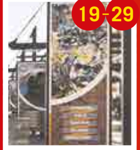
BANNERS LINKEDTO RED LOCATION

This is a series of posters, showing 'teaser' sections of 10 of the works acquired to form the basis of the permanent collection of the new Red