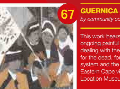
by community collaboration

The Children's Memorial is conceptually linked to the Donkin Mosaic Moments, and through this, a subtle connection is established between these